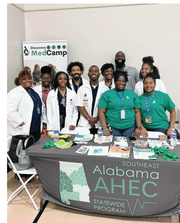
Southeast Alabama AHEC Scholars serving at the True Deliverance's Annual Health and Resource Fair Festival, Saturday Oct. 14th.

The AHEC Scholars Webinars are a reoccurring series hosted by the Alabama Statewide AHEC program office that takes place the last Friday of each month from October to April from 12 pm - 1 pm. November and December's webinars, however, take place on the third Fridays of the month due to holidays.